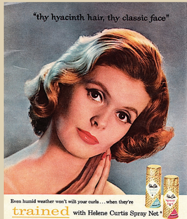
1957 Helene Curtis Advertisement

Although the Great Depression was bad for the country, it turned out to be a huge boon for Helene Curtis. Women's hairstyles changed from straight to wavy, but electric waving machines were very expensive, putting these styles beyond the reach of all but the wealthy. It was at this time that the