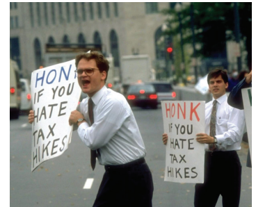
Outside the White House protesting George H.W. Bush's broken "read my lips" promise.

These things aren't likely to win us many popularity contests, but they help us win something much more important... liberty.