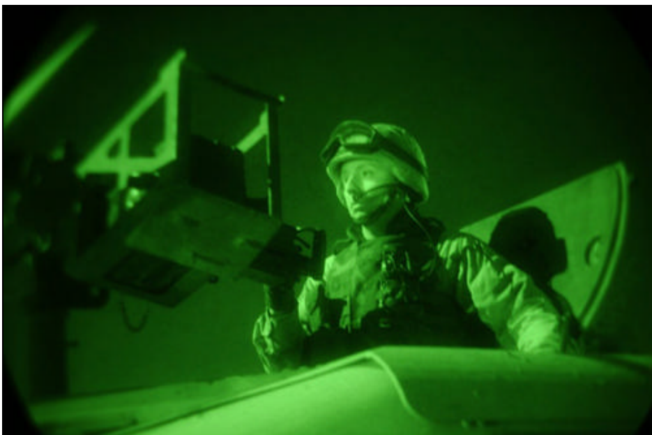
A paratrooper attached to 1st Armored Division from 2nd Battalion, 504th Parachute Infantry Regiment, stands ready with a 50-caliber machinegun during "Operation Devil Clinch."