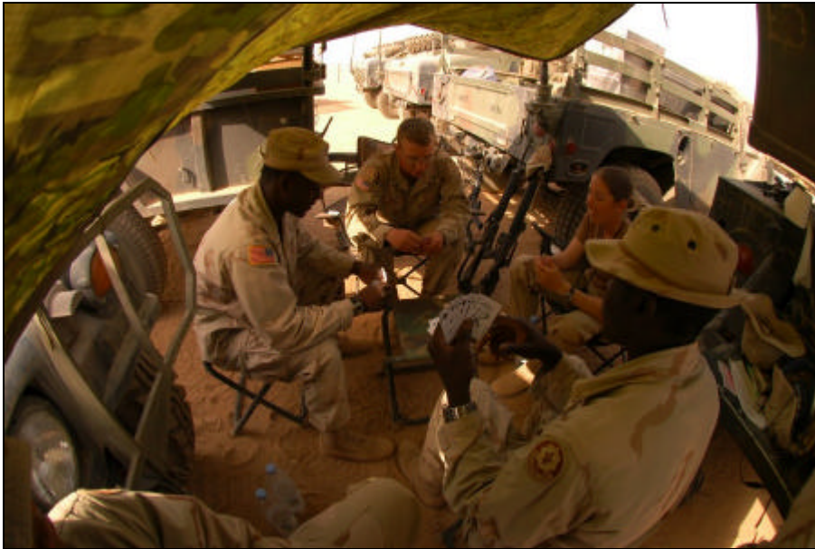
Signal Soldiers from Regimental Headquarters and Headquarters Troop, 2nd Armored Cavalry Regiment, play cards during some downtime.