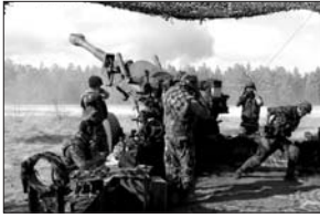
5th Battalion, 10th Marine Regiment Fort Bragg (North Carolina)

Every tree that potentially could be home to a Red Cockaded Woodpecker requires a 200-foot “buffer area” in which soldiers must be careful not to “upset” or “harass” the birds.