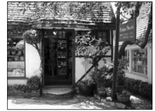
The infamous step at Cottage of Sweets in Carmel, California

Sources: Statement of Representative Sam Graves (R-MO) (April 28, 2003), Carmel Pine Cone (April 4-10, 2003; July 23, 2004), The Cottage of Sweets, Gene Zweben, Lanny Rose, MontereyHerald.com (April 4, 2003), U.S. Department of Justice