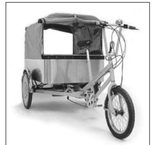
Soft Top Pedicab