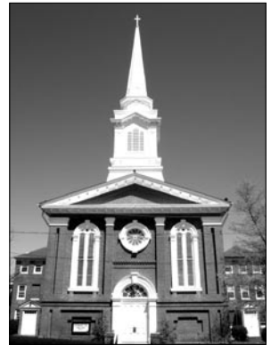
Warrenton Baptist Church in Warrenton, Virginia

Sources: Washington Post (February 22, 2004), Fauquier Citizen, Fauquier Times-Democrat