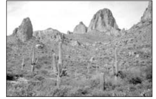
Upper Sonoran Desert vegetation along the Apache Trail in central Arizona

Sources: Arizona Daily Star (2001-2004 coverage), The Tucson Citizen (June 13, 2002), The Washington Times (May 11, 2002; May 17, 2004), Associated Press (July 1, 1999; May 22, 2004)