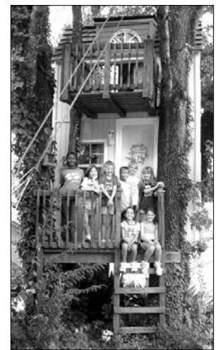
Clinton, Mississippi treehouse