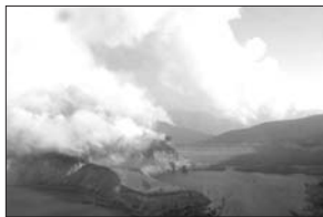
Curve and Williams Fire

Sources: Americans for Tax Reform, Office of Congressman Richard Pombo, Dubuque Telegraph Herald (April 6, 2003)