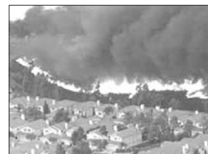
The Cedar Fire

Sources: Los Angeles Times (October 28, 2003), San Diego Union-Tribune (November 8, 2003; January 18, 2004; March 13, 2005), California Department of Forestry, San Francisco Chronicle (October 29, 2003), Associated Press (October 30, 2003; October 31, 2003), Testimony on the Cedar Fire: The Blue Ribbon Fire Commission (January 21, 2004)