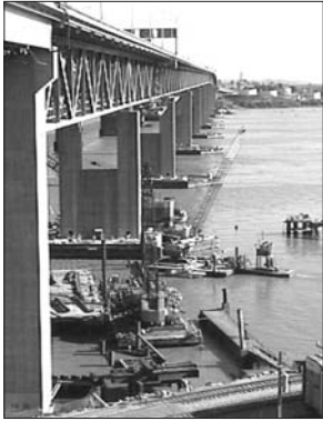
New Benicia-Martinez Bridge (1999)