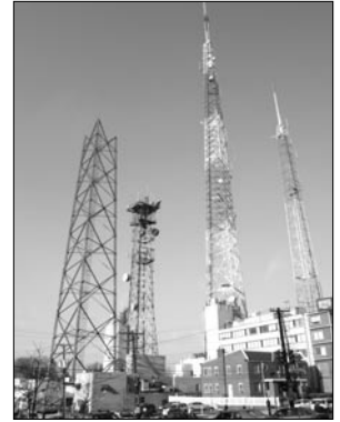
The unfinished cell phone tower in the Tenleytown neighborhood of Washington, D.C.

Sources: Washington Post (November 1, 2002), Northwest Current (March 19, 2003), Washington Times (October 23, 2000; November 30, 2003)