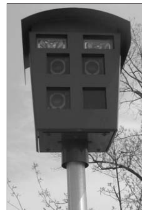
A Washington, D.C. traffic camera