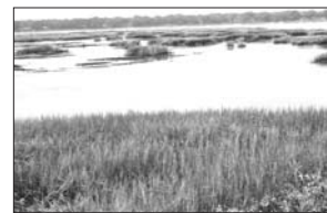
A wetland along the Beaufort River Beaufort, South Carolina