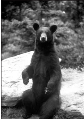
American Black Bear

"No matter what happens, if you shoot a bear, you're in trouble."