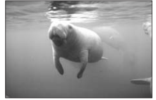
West Indian Manatee

In 2007, government officials issued 25 citations in two days for boat operators speeding in a manatee protection zone of the Chokoloskee Bay in the Florida Everglades