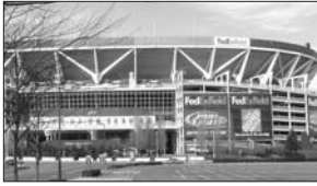
FedEx Field Landover, Maryland