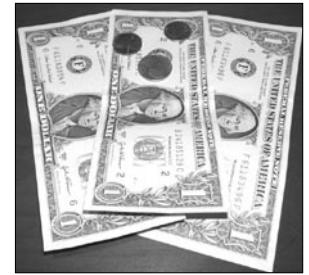
$3.16 in taxes earned a 14-year-old a $352 fine.