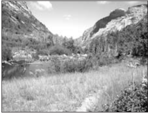
Nature trail in Lamoille Canyon, Humboldt-Toiyabe National Forest