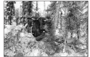
1st Brigade, 9th Engineer Battalion Ft. Richardson (Alaska)

Claiming the Army has not adhered to federal regulations of RCRA, the Clean Water Act, the Comprehensive Environmental Response, Compensation and Liability Act (Superfund law), eight parties including the Military Toxics Project and Alaska Community Action on Toxics filed suit in April 2002 in the U.S. District Court for the District of Alaska in Anchorage seeking a halt to Army artillery training on the Eagle River Flats, adoption of an appropriate clean-up plan and a declaration that unexploded ordnance on land or water constitutes a "hazardous substance or contaminant."