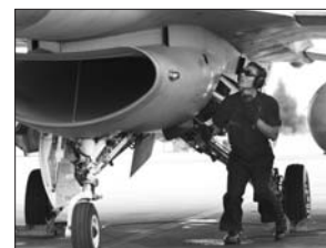
A maintenance worker at Luke Air Force Base (Arizona)

Sources: Defenders of Wildlife, National Wildlife Federation, National Journal (April 26, 2003), Government Executive Magazine (October 1, 2002), Luke Air Force Base