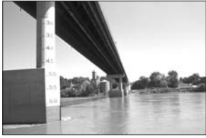
Missouri River Bridge

“The increased congestion and air pollution stemming from the loss of river transportation [will] be immense.”