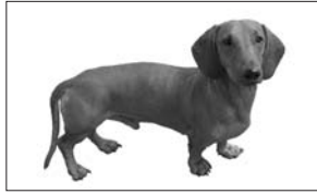
A wiener dog

"I could have either thrown up my hands or fight."