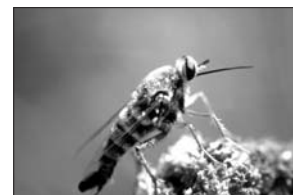
Delhi Sands Flower-Loving Fly

Efforts to determine the snake's cause of death brought all work on the new rail extension to a virtual standstill.