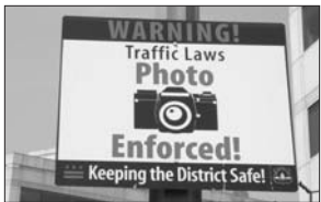
A Washington, D.C. traffic sign

Sources: Shattered Dreams: 100 Stories of Government Abuse (2003 Edition) , Institute for Justice, New Jersey ACLU