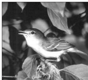
Least Bell's Vireo

Sources: New York Times (December 12, 2002), LibertyMatters.org, Press-Enterprise (September 21, 2002), Inland Valley Daily Bulletin (December 17, 2004), Public Policy Institute of California