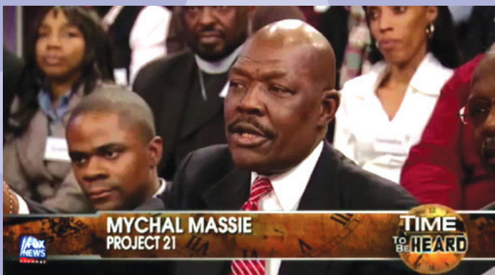
Project 21 Chairman Mychal Massie appearing (with five other Project 21 members) on a special town hall-style edition of the Glenn Beck show highlighting the opinions of black conservatives.

Congressional Black Caucus members have alleged that Tea Party activists hurled racial epithets and spit on them.