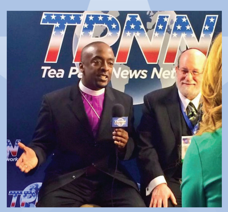
Project 21 spokesman and Episcopal Missionary Church Bishop Council Nedd II discussed religious liberty in an interview with the Tea Party News Network at CPAC.

Your support ensures that Project 21 can continue showing how big-government programs hurt those they were intended to help.