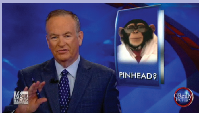
Fox’s Bill O’Reilly covering the hurricane forecast of Dr. Hansimian, the trained chimp we put up against NOAA forecasters, on his popular “Pinheads and Patriots” segment.

Taking these corporations out of the game, or better yet,