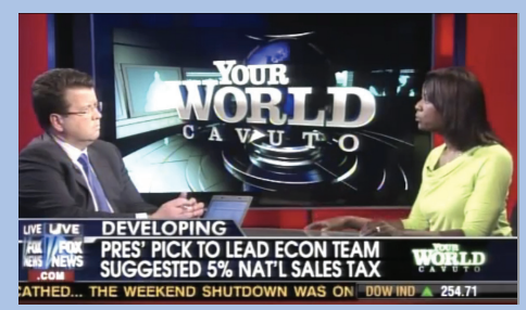
Deneen Borelli criticizes White House Council of Economic Advisors Chairman-designate Alan Krueger's tax plan on "Your World with Neil Cavuto."

for cynically using concern over global warming as a means of raising fossil fuel prices in the hope of increasing demand for GE wind turbines and other renewable energy products.